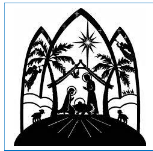
MASSES FOR THE WEEK