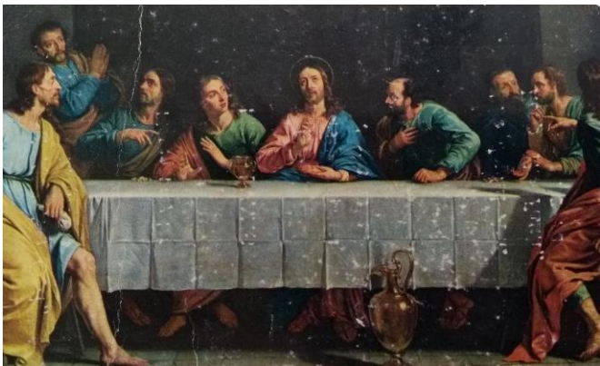
Come to the table of the Lord.

On the subject of fine dining, Lord Lisvane told a story about Roy Jenkins attending a Labour event in Pontypool and being distressed by the menu choices. The urbane Home Secretary signalled to a waitress and asked "Could you get me some aspawagus tips?"