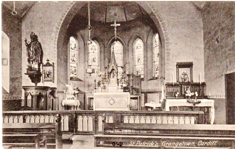
Interior of the original St Patrick's Church. Durham St.

school day and children from quite far away would hasten to school lest they should be late.