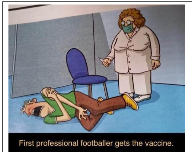
First professional footballer gets the vaccine.

The story of Adam and Eve was being carefully explained in the children's religious education class. Following the story, the children were asked to draw some pictures that would illustrate what happened.